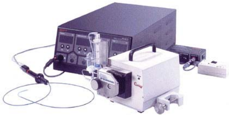
Fig 4. CircuCool™ Pump And Model 1000TC Generator (EP Technologies/Boston Scientific).

Researchers have sought to compare the three types of systems to look at both safety and efficacy. A study by Demazumder et al. 6 utilized an in vitro model. They found that larger lesion sizes could be achieved with showerhead or sheath models; however the risk of crater and complex lesion formations was increased, suggesting that further studies were needed.