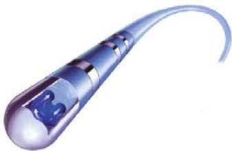
Figure 3. The Chilli® Catheter (EP Technologies/Boston Scientific).

Three catheter designs for tip cooling have been investigated at length. The first type, perhaps the low tech version, uses a long sheath of slightly larger diameter than the ablation catheter. The ablation catheter is advanced through the sheath and saline flows externally around the ablation catheter and bathes the tip-tissue interface and surrounding tissue. This is an "open system" in which saline is continuously infused and empties into the blood pool. A disadvantage of this system is the sheath itself, the presence of which limits potential sites on which it may be used. The second type of system is a method of internal irrigation through the catheter tip, also an open system. Saline is conducted down the body of the catheter and is forced out of holes in the porous catheter tip. This has been described as a showerhead or sprinkler design (Cordis Webster/Medtronic). The third also involves internal perfusion of the catheter tip. Saline is perfused via a pump mechanism through the catheter tip, turns around within the catheter tip, and returns back to the pump. This represents a closed system because no saline is infused into the blood pool (Chilli®, EPT/Boston Scientific). An illustration of all three systems is seen in Figure 2.